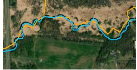
Orange line – existing stream data Blue line – improved county data

Within the next 6 months the Data Catalog subgroup will have a list of data layers widely used in Minnesota, along with information about user needs that are not being met by the existing data. This data will be presented to the Hydrogeomorphology Workgroup to aid them in determining requirements to be able to provide modern LiDAR-derived hydrography data in Minnesota.